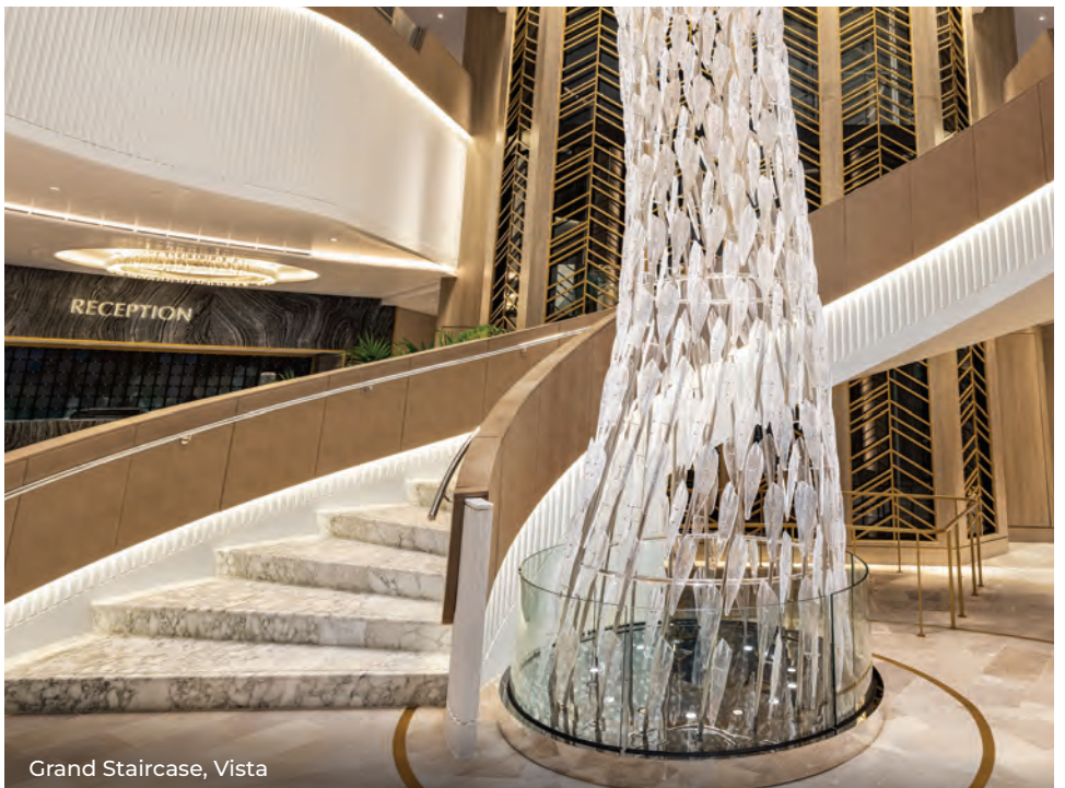
Grand Staircase, Vista