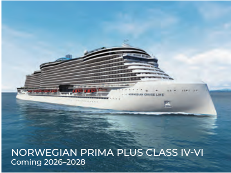
NORWEGIAN PRIMA PLUS CLASS IV-VI Coming 2026-2028