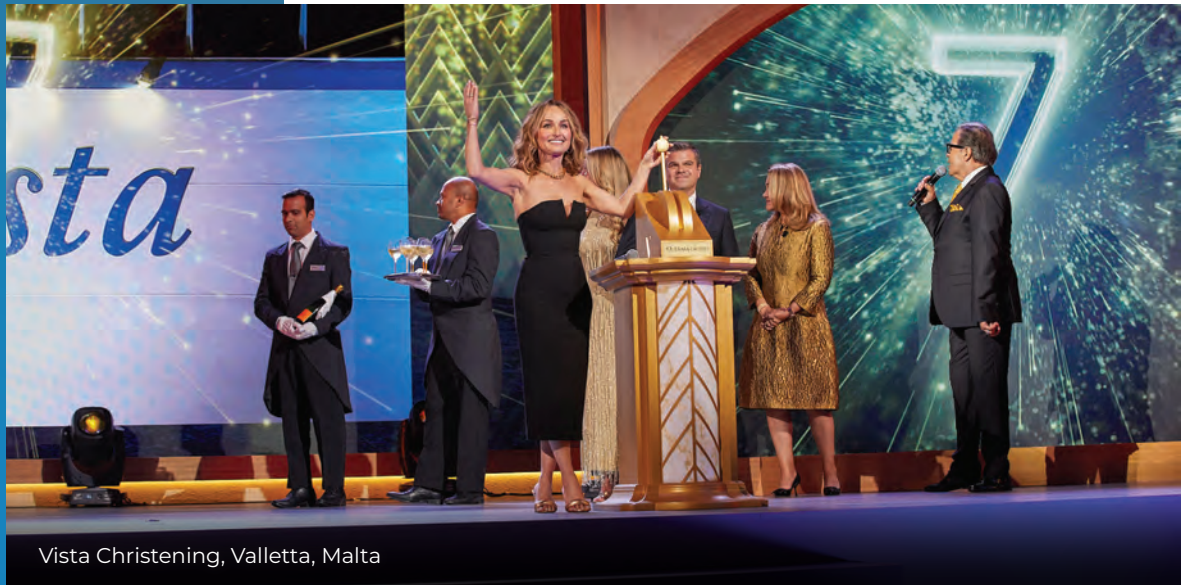
Vista Christening, Valletta, Malta