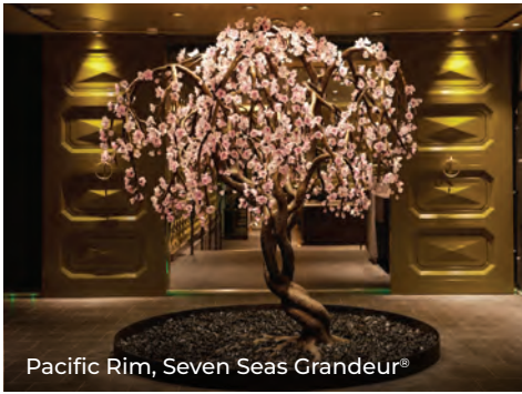
Pacific Rim, Seven Seas Grandeur®