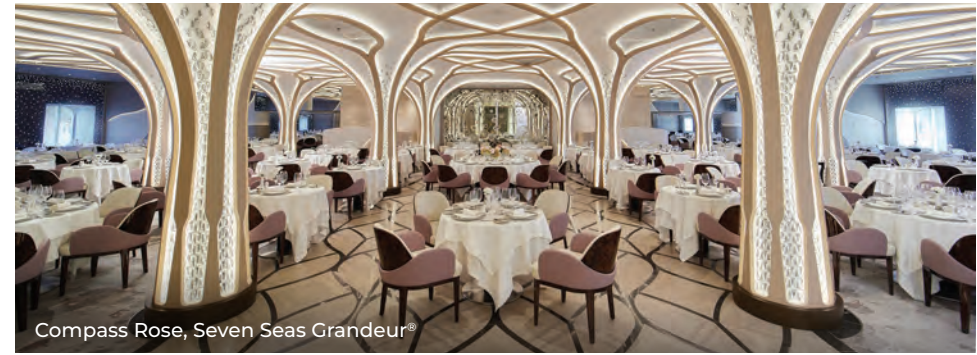
Compass Rose, Seven Seas Grandeur®