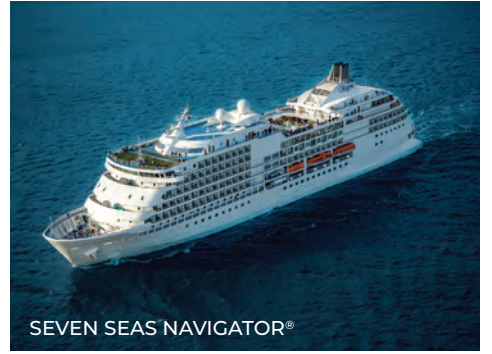
SEVEN SEAS NAVIGATOR®