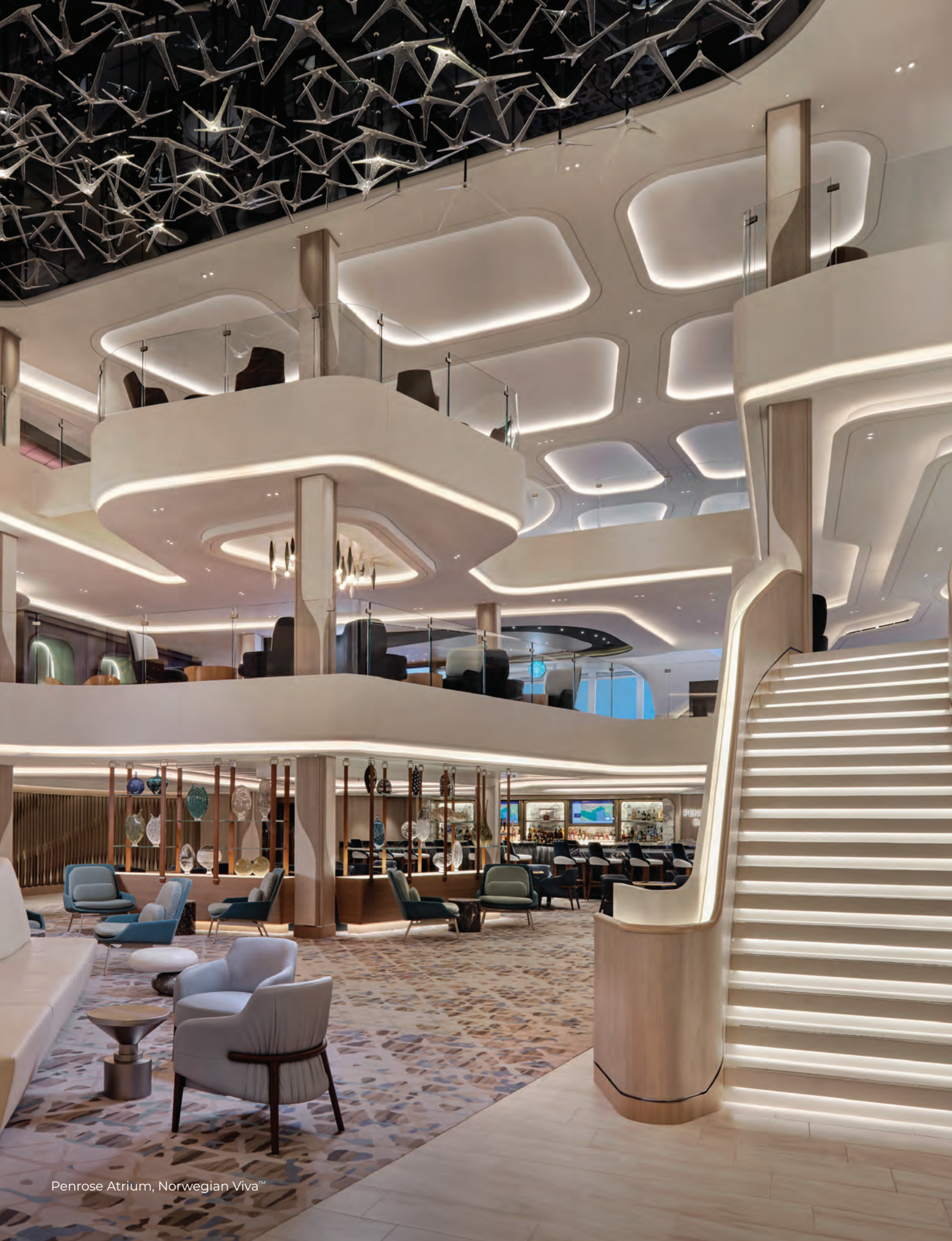
Penrose Atrium, Norwegian Viva™