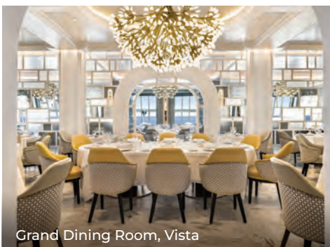
Grand Dining Room, Vista