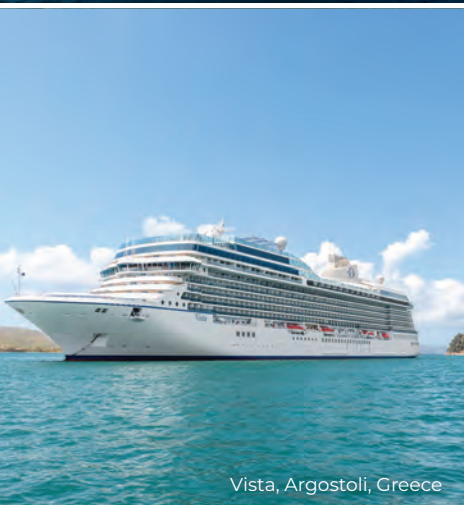
Vista, Argostoli, Greece

As the innovator in global cruise travel, Norwegian Cruise Line® has been breaking the boundaries of traditional cruising for over 57 years. Most notably, the cruise line revolutionized the industry by offering guests the freedom and flexibility to design their ideal vacation on their preferred schedule with no assigned dining and entertainment times and no formal dress codes. Today, its fleet of 19 contemporary ships sails to over 400 of the world's most desirable destinations, including Great Stirrup Cay, the Company's private island in the Bahamas, and its resort destination Harvest Caye in Belize.