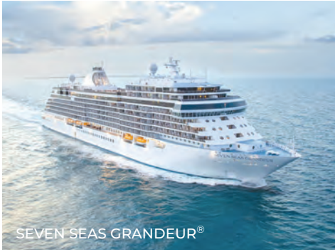
SEVEN SEAS GRANDEUR®