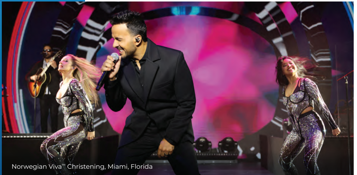
Norwegian Viva™ Christening, Miami, Florida