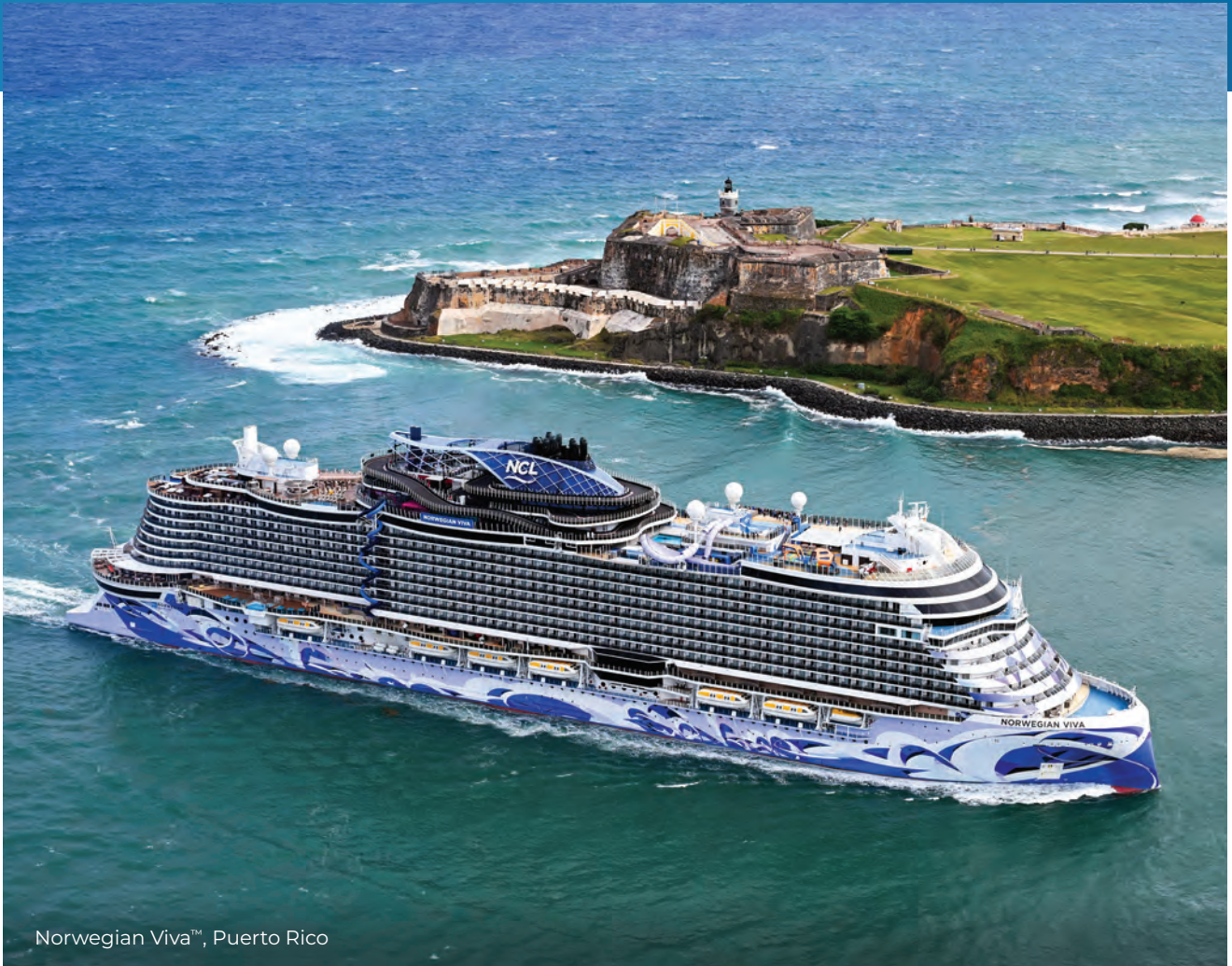
Norwegian Viva™, Puerto Rico