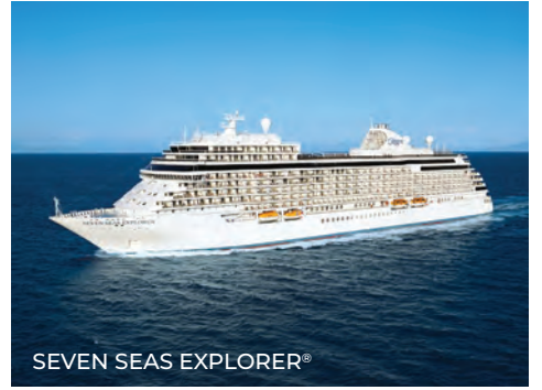
SEVEN SEAS EXPLORER®