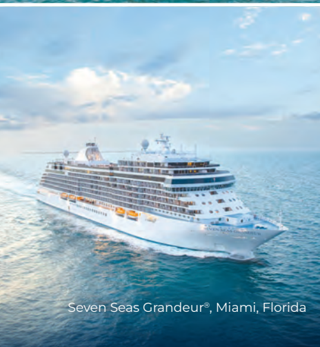
Seven Seas Grandeur®, Miami, Florida

Oceania Cruises is the world's leading culinary- and destination-focused cruise line. The line's eight small, luxurious ships carry a maximum of 1,250 guests and feature The Finest Cuisine at Sea® and destination-rich itineraries that span the globe. With expertly curated travel experiences aboard, the designer-inspired, small ships call on more than 600 marquee and boutique ports in more than 100 countries on seven continents on voyages that range from seven to more than 200 days. The brand has a second 1,200-guest Allura Class ship on order for delivery in 2025.