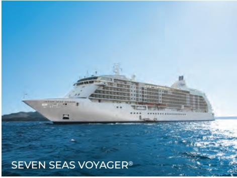
SEVEN SEAS VOYAGER®