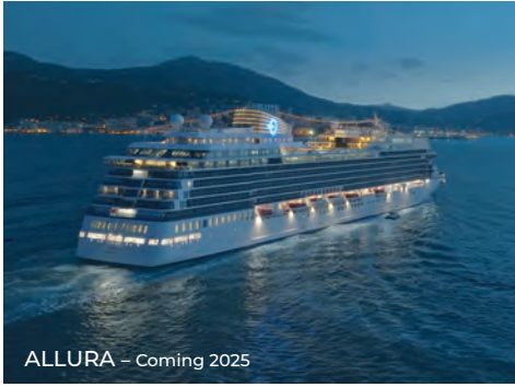
ALLURA – Coming 2025