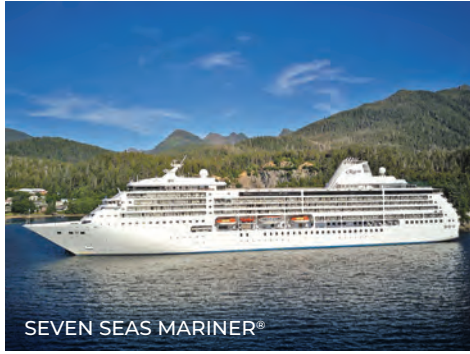
SEVEN SEAS MARINER®