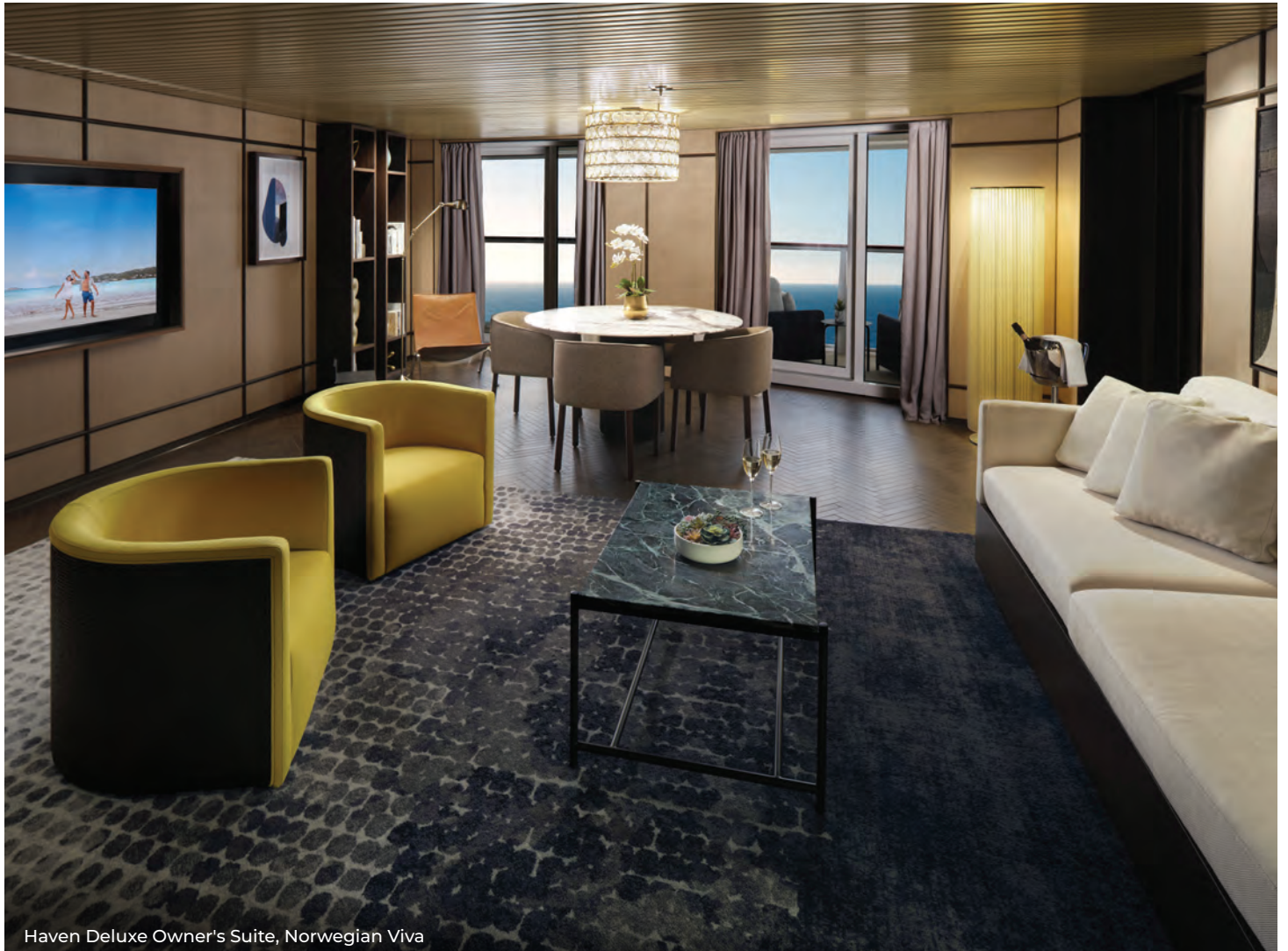
Haven Deluxe Owner's Suite, Norwegian Viva