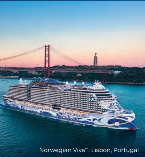
Norwegian Viva™, Lisbon, Portugal

Norwegian Cruise Line Holdings Ltd. (NYSE: NCLH) is a leading global cruise company which operates the Norwegian Cruise Line, Oceania Cruises and Regent Seven Seas Cruises brands. With a combined fleet of 32 ships and approximately 66,500 berths, these brands offer itineraries to more than 700 destinations worldwide. The Company expects to add 13 additional ships across its three brands through 2036, which will add approximately 41,000 berths to its fleet.