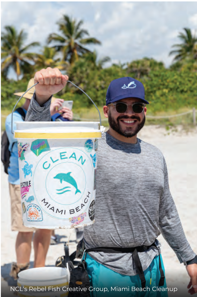
NCL's Rebel Fish Creative Group, Miami Beach Cleanup