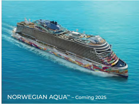
NORWEGIAN AQUA™ – Coming 2025