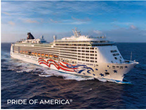
PRIDE OF AMERICA®