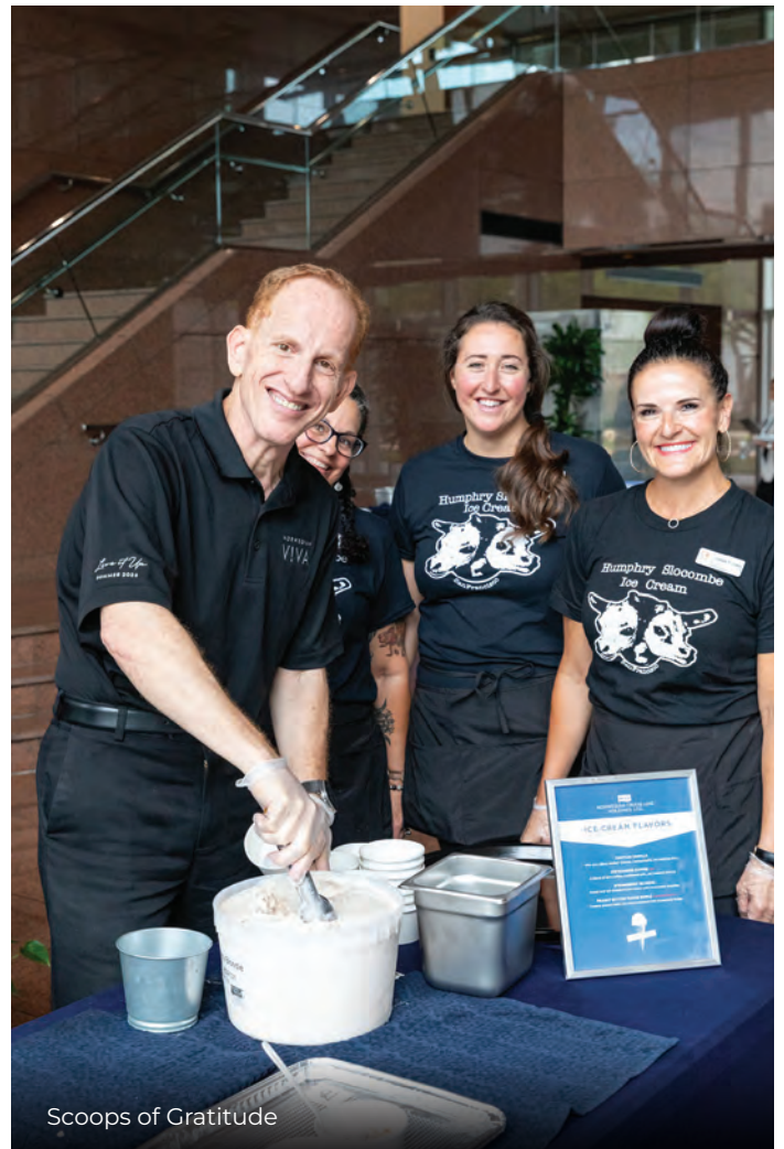
Scoops of Gratitude