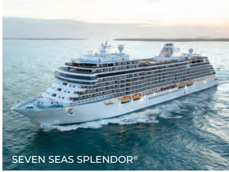
SEVEN SEAS SPLENDOR®