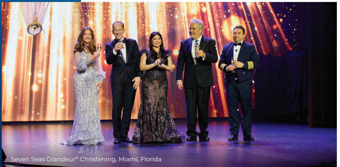
Seven Seas Grandeur® Christening, Miami, Florida