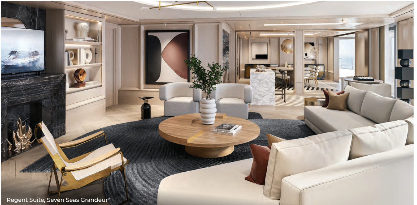
Regent Suite, Seven Seas Grandeur®