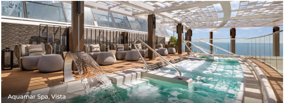
Aquamar Spa, Vista